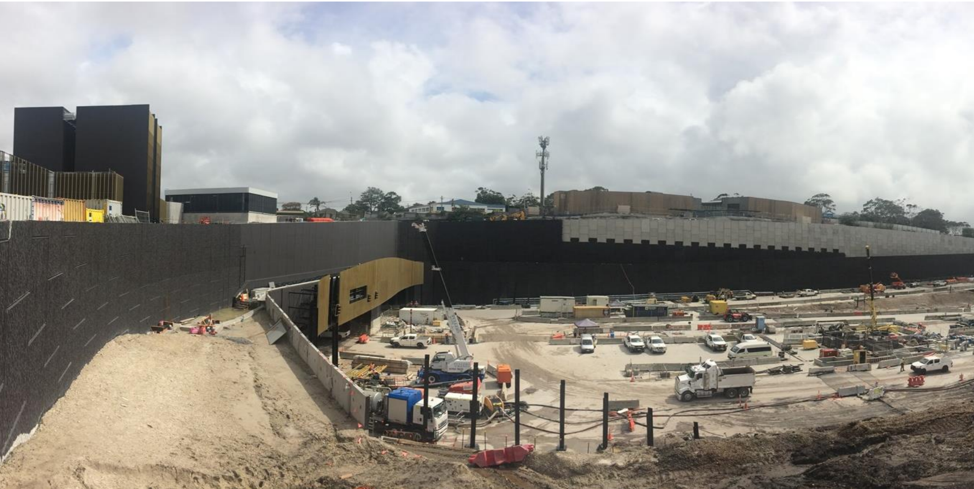
View from the shared path to the T2 mound, overlooking the New M5 tunnel portal entry and exit