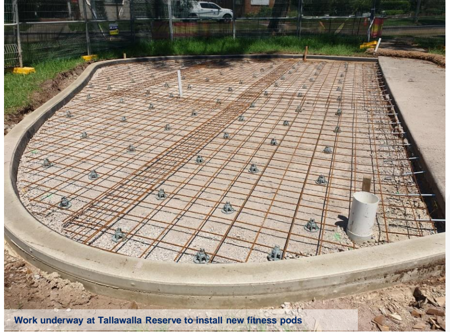
Work underway at Tallawalla Reserve to install new fitness pods