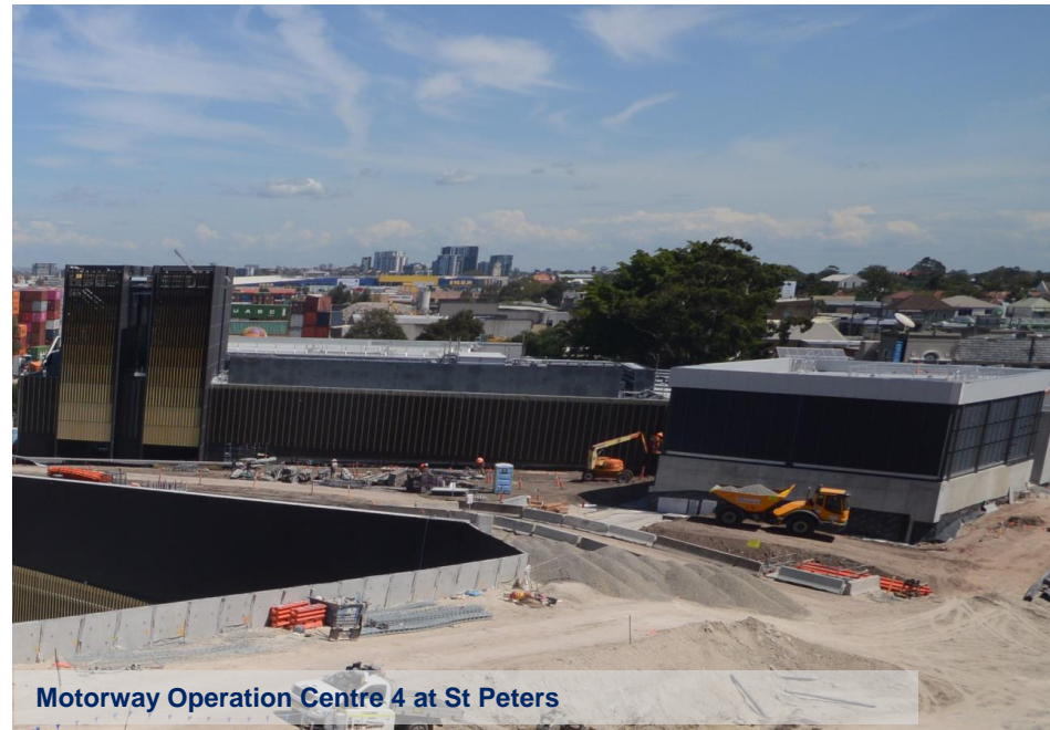
Motorway Operation Centre 4 at St Peters