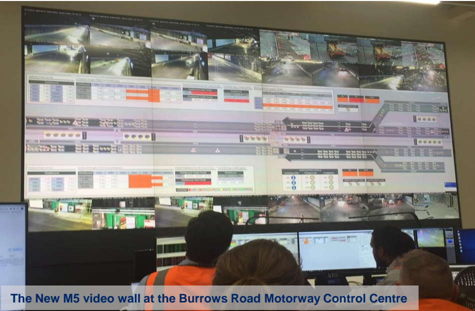
The New M5 video wall at the Burrows Road Motorway Control Centre