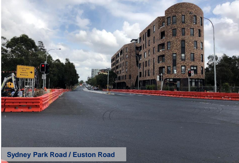
Sydney Park Road / Euston Road