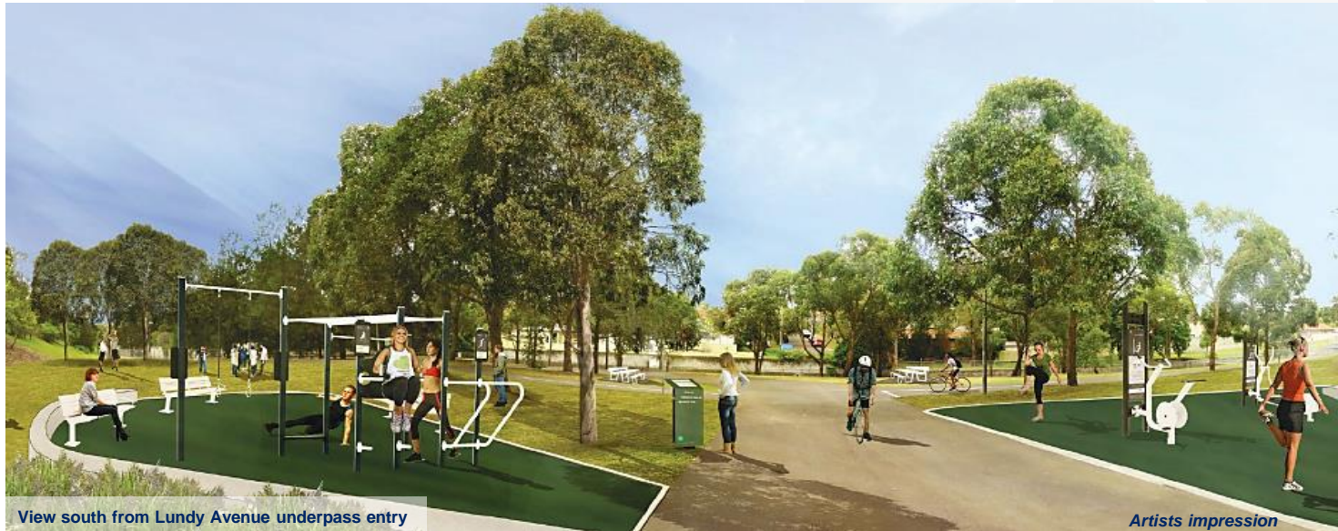
View south from Lundy Avenue underpass entry