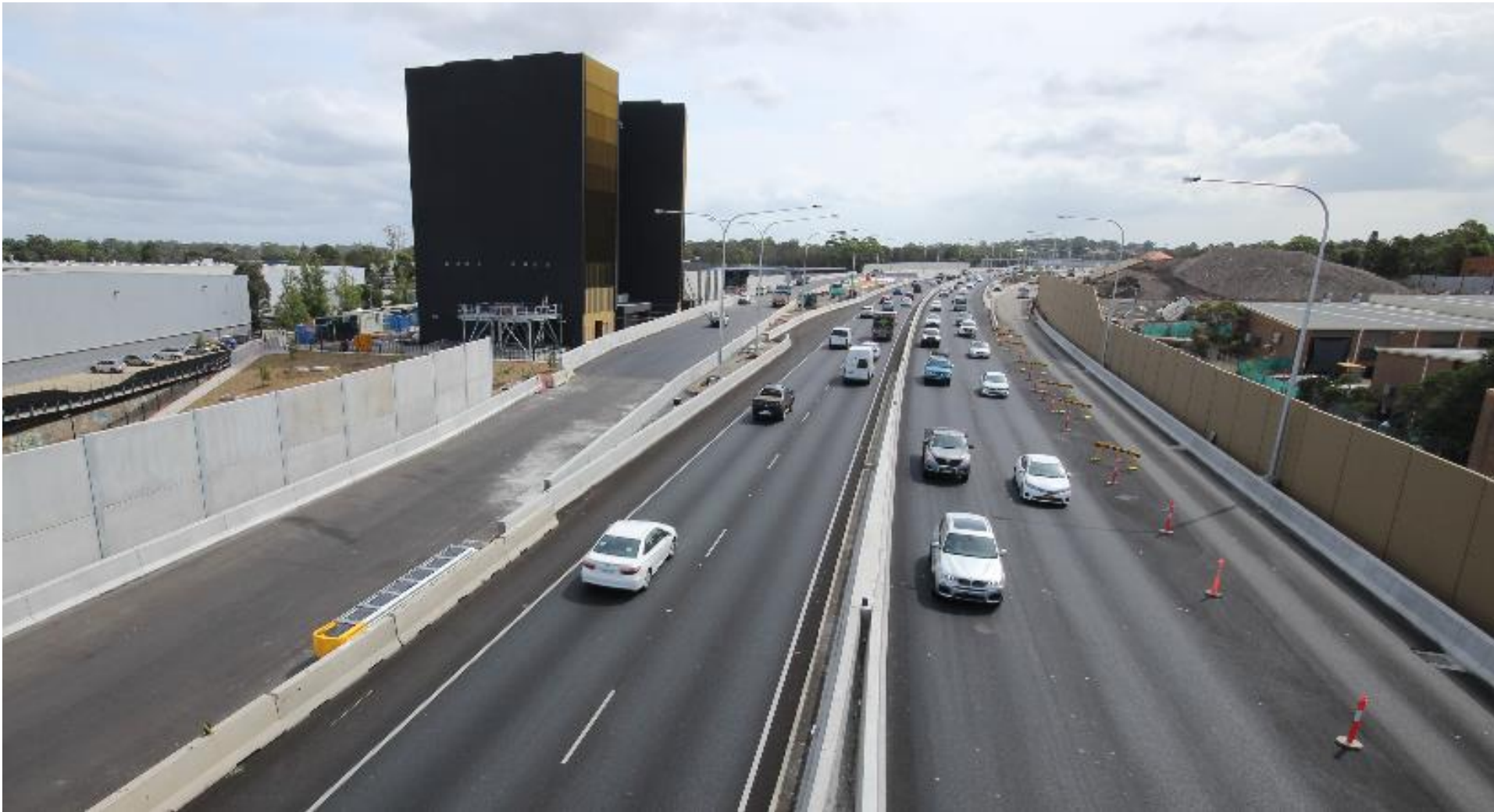
Motorway Operation Complex 1 at Kingsgrove, adjacent the M5 East

Western Surface Works – Kingsgrove / Beverly Hills