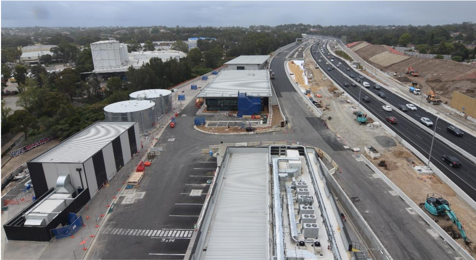
View from atop Motorway Operation Complex 1 at Kingsgrove

Western Surface Works – Kingsgrove / Beverly Hills