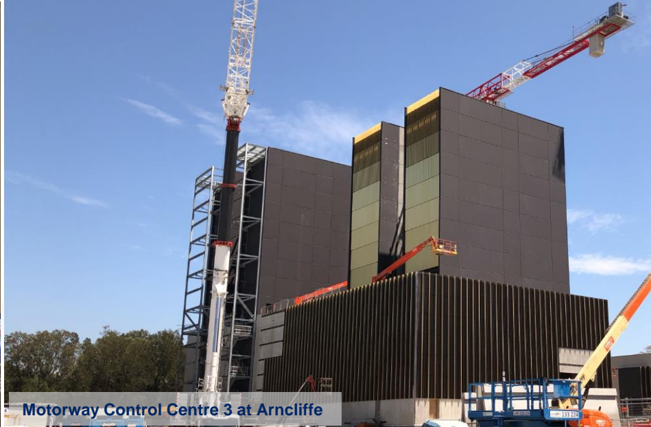
Motorway Control Centre 3 at Arncliffe