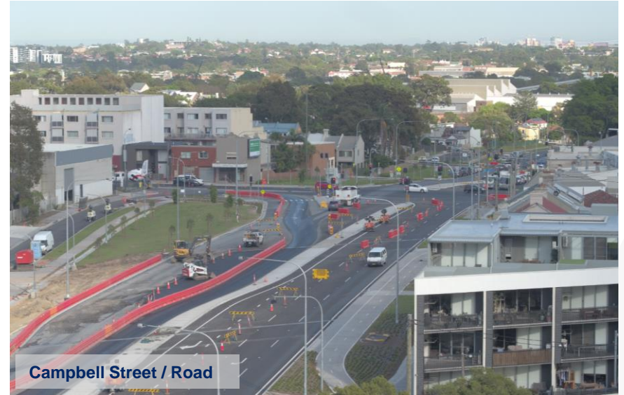
Campbell Street / Road