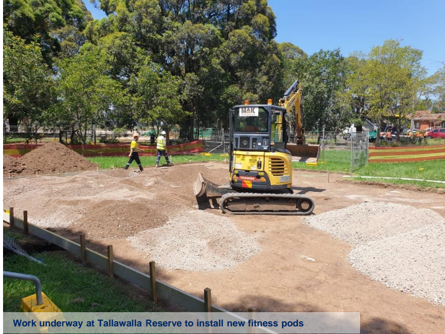
Work underway at Tallawalla Reserve to install new fitness pods